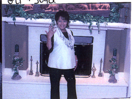
23 weeks + counting